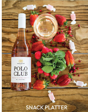
SNACK PLATTER & POLO CLUB CHA PINO R345

Take-away snack platter options available to enjoy at home