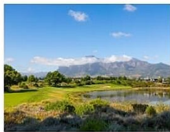
NO NAME PAIRS GOLF EVENT 28/29/30 JULY 2023