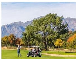
CLUB CHAMPIONSHIP 4 AND 5 NOVEMBER 2023