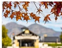
PEARL VALLEY'S 20 TH BIRTHDAY CELEBRATION 17 AND 18 NOVEMBER 2023