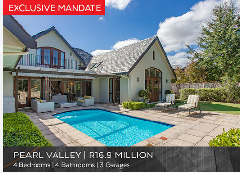
PEARL VALLEY | R16.9 MILLION 4 Bedrooms | 4 Bathrooms | 3 Garages