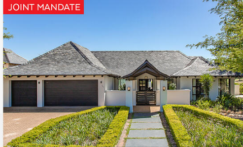
PEARL VALLEY | R20 MILLION 5 Bedrooms | 5 Bathrooms | 3 Garages