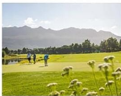
RICTS PEARL VALLEY PRO-AM 13 AND 14 AUGUST 2023