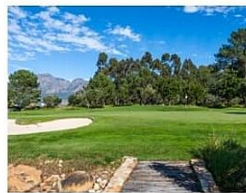
JACK NICKLAUS QUALIFIER 19 AUGUST 2023