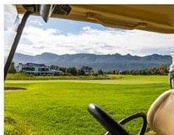
MEMBERS CHARITY GOLF DAY 21 OCTOBER 2023