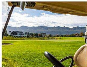
MEMBERS CHARITY GOLF DAY 21 OCTOBER 2023