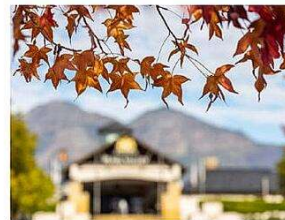
PEARL VALLEY'S 20 TH BIRTHDAY CELEBRATION 17 AND 18 NOVEMBER 2023