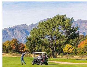
CLUB CHAMPIONSHIP 4 AND 5 NOVEMBER 2023