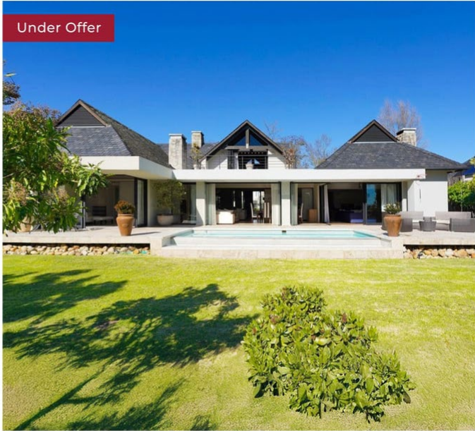
Pearl Valley Golf and Country Estate | R17.9 million 4 Bedrooms | 3 Bathrooms | 3 Garages

Agents registered with the PPRA - Full Status FFC. Pam Golding Properties (Pty) Ltd - Paarl Luxury Estates. Registered with the PPRA. Holder of a Business Property Practitioner FFC. Operating a Trust Account. W: +27 21 300 1658 | E: paarluxuryestates@pamgolding.co.za