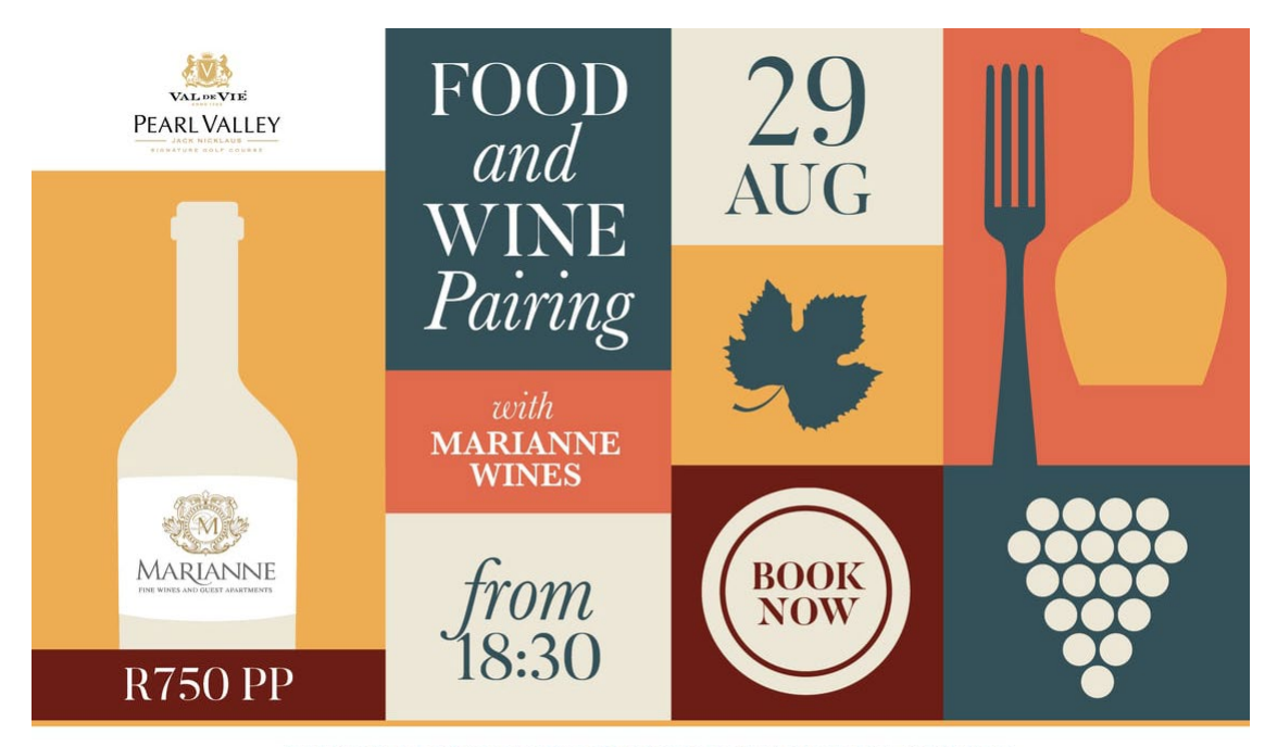
THE VALLEY RESTAURANT SIGNATURE LOUNGE