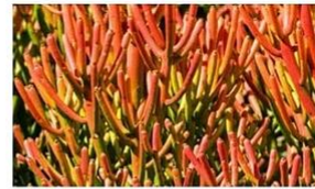
Fire Sticks Plant

The Estate's Environmental Team has confirmed that these plant species contain poisonous properties that are harmful to humans and animals. Broken stems emit a toxic, milky sap that can require emergency medical care if it gets in your eyes or on your skin.