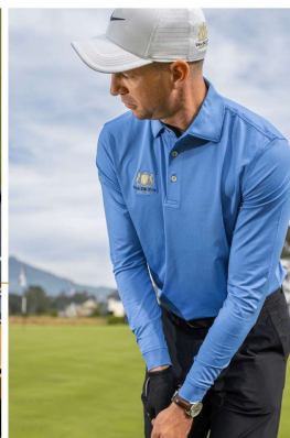
Peter Millar long-sleeve shirt