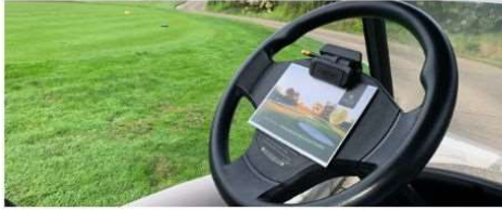
CLUB CHAMPIONSHIP: 4 & 5 NOVEMBER 2023