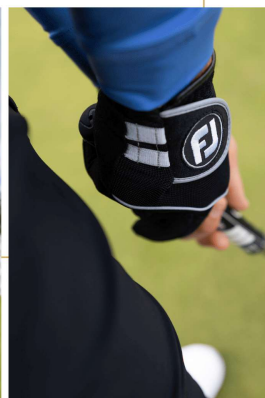
FootJoy rain glove