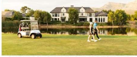
CAPTAIN'S CHARITY GOLF DAY: 21 OCTOBER 2023