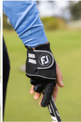
FootJoy rain glove