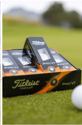
Twelve Pro V1 or X golf balls with your dad's name on them