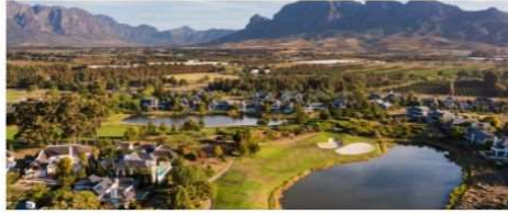
PEARL VALLEY'S 20TH BIRTHDAY CELEBRATION: 17 & 18 NOVEMBER 2023