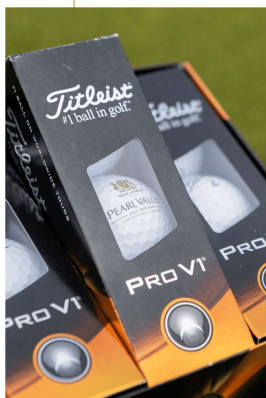
Twelve Pro V1 or X golf balls with your dad's name on them