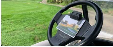
PEARL VALLEY PRO-AM: 13 & 14 AUGUST 2023