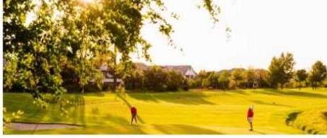
NO NAME PAIRS GOLF EVENT: 28/29/30 JULY 2023