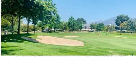
JACK NICKLAUS QUALIFIER: 19 AUGUST 2023